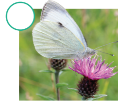
Large white butterfly