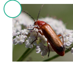
Red soldier beetle