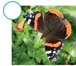
Red admiral butterfly