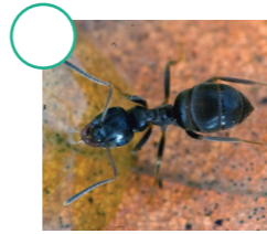
Garden black ant