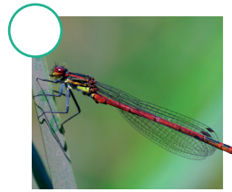
Large red damselfly

Great Yorkshire Creature Count – Head outdoors into your local park, nature reserve, neighbourhood or your garden for just 30 minutes and then spot, count and record the wildlife that you find – Submit your counts at ywt.org.uk/submit-gycc-sightings