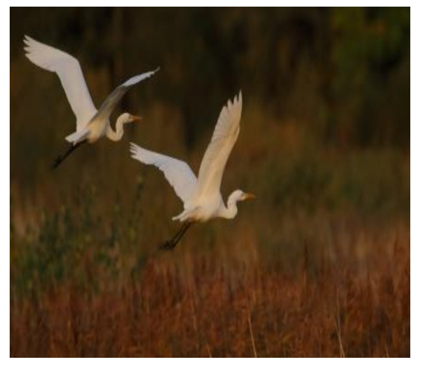
Great white egret