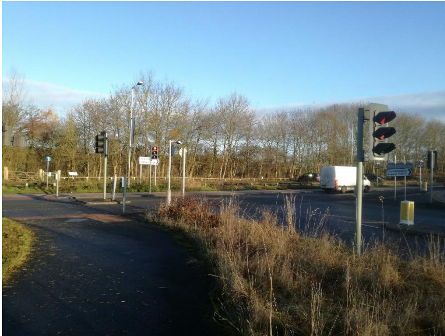
Photo 5 – Tadcaster Road as it emerges from the Underpass – Askham Bog car park and entrance in distance