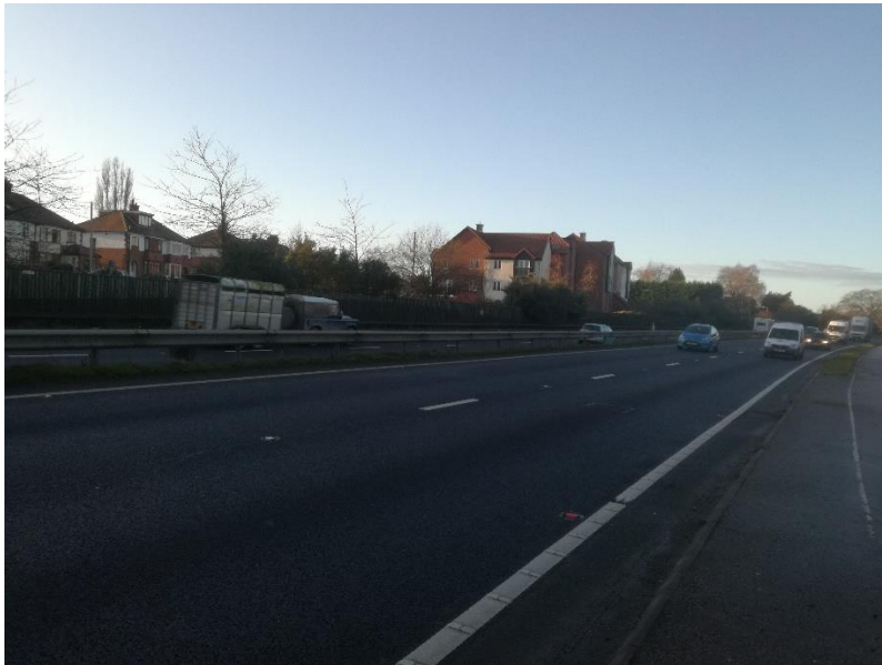
Photo 1: A64, by Pike Hills Golf Course (see cover map for location)