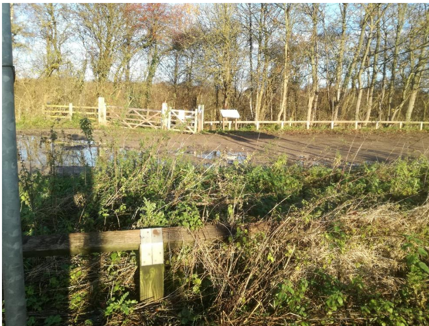
Photo 6: Close-up of Askham Bog car park – illustrates where visitors emerge.