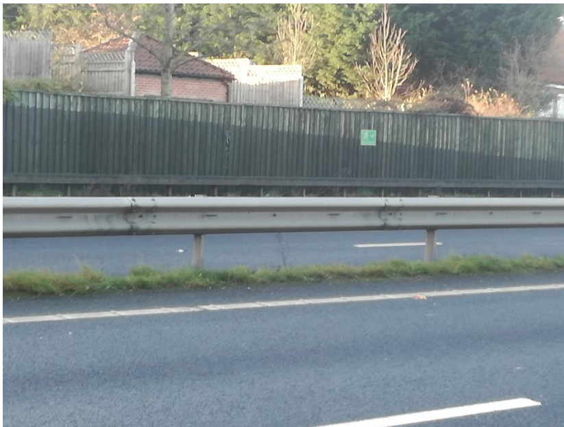
Photo 2: Closer image of the fence on the Copmanthorpe side of the A64