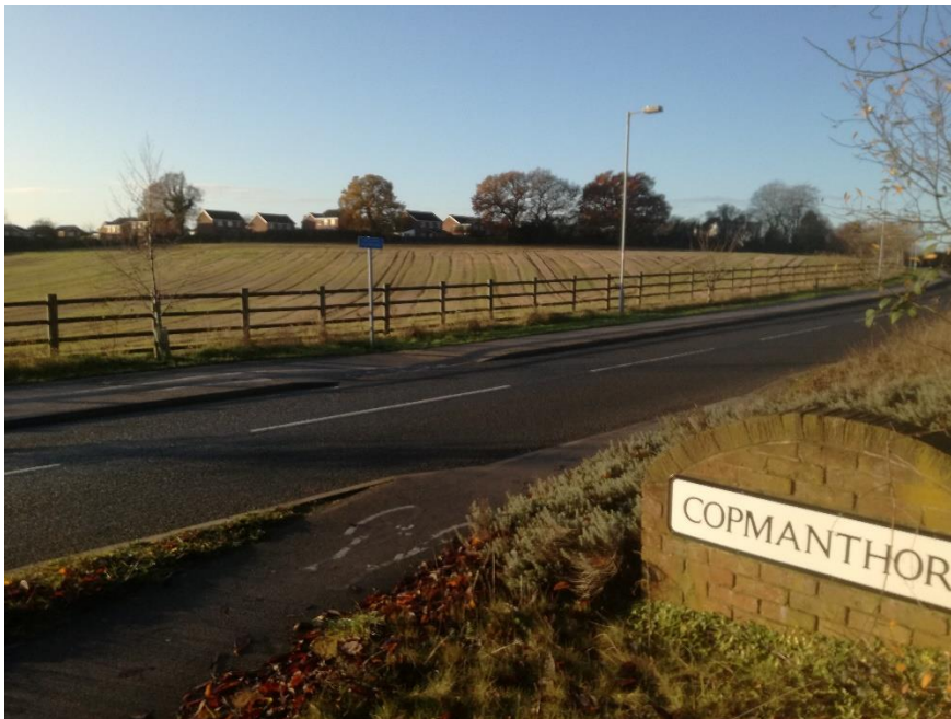
Photo 4 – Tadcaster Road – Copmanthorpe in distance – to provide context