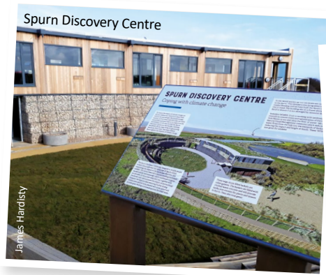
Spurn Discovery Centre

Journey to Yorkshire's very own Land's End at Spurn National Nature Reserve. Head to Yorkshire Wildlife Trust's Discovery Centre and café and pack a wild adventure into one day! (1hr 40 mins drive from Bridlington, HU12 0UH)