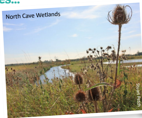
North Cave Wetlands

Journey between sites and enjoy more wildlife summertime action at several fabulous reserves, as you head west along the Humber.