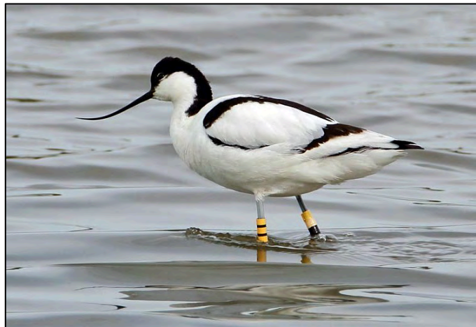
Redstart ringed on 17th and the wandering colour-ringed Avocet