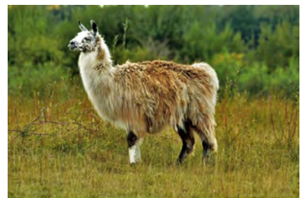
Llama grazing in Central Grassland