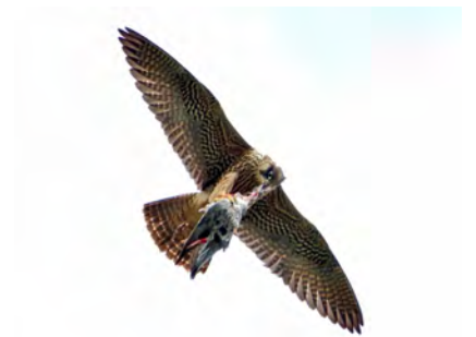
Peregrine with pigeon