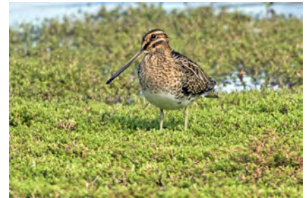
Snipe © Adrian Andruchiw