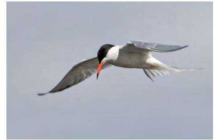
Common tern