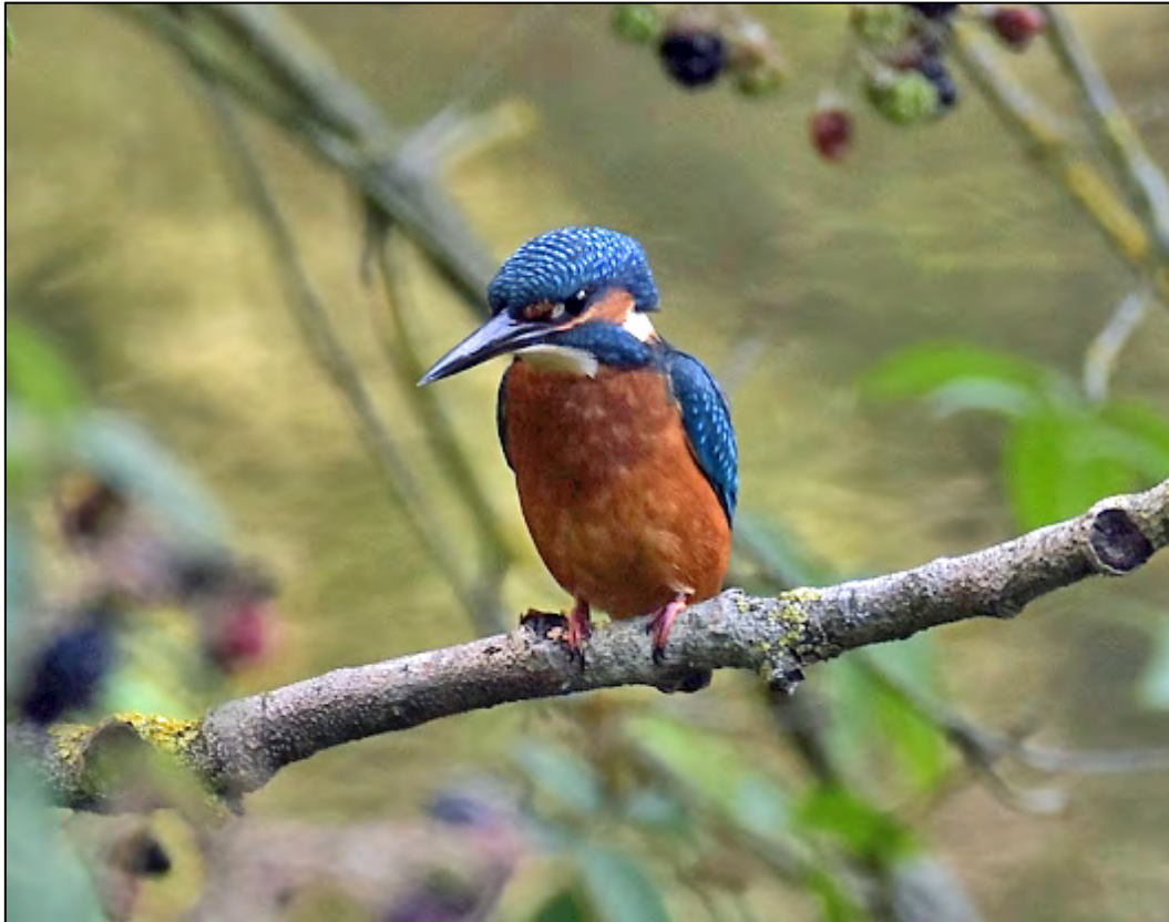
Kingfisher on 11th August