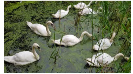
Mute swans feeding along Piper Marsh Drain