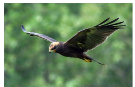
Marsh harrier juv