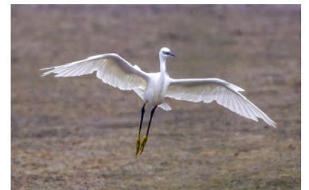
Little egret