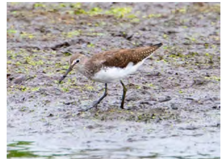
Green sandpiper