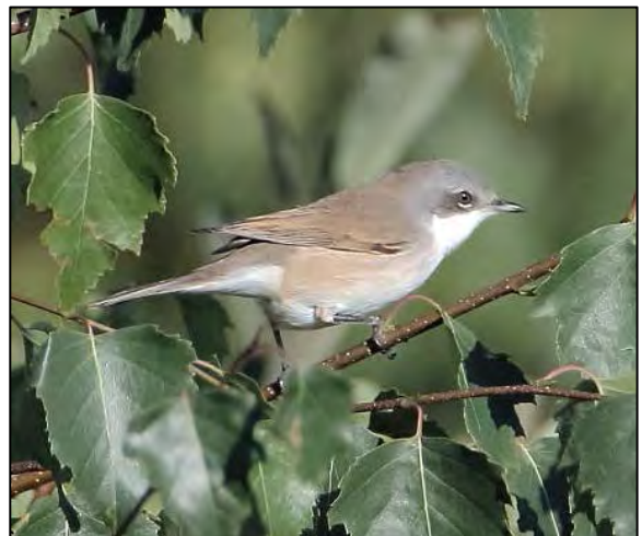
Green sandpiper and Lesser whitethroat