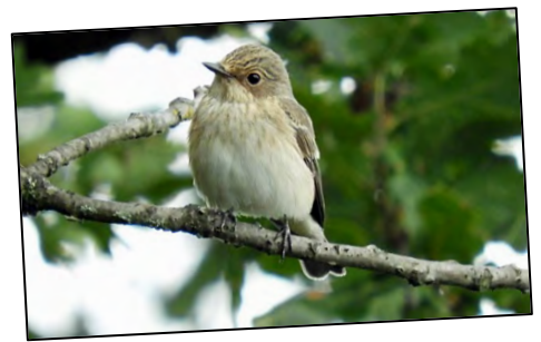
Water rail, Common tern juv and Spotted flycatcher