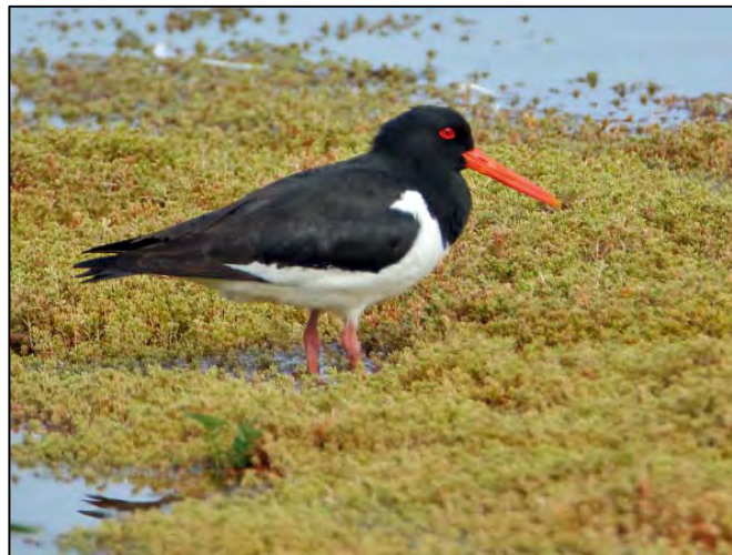
Juvenile Bittern on 23rd and Oystercatcher