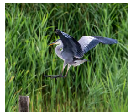
Grey heron