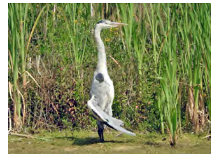
Grey heron