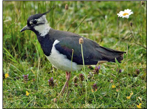
Green sandpiper and Lapwing