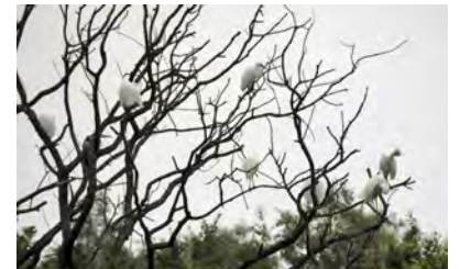
Little egrets