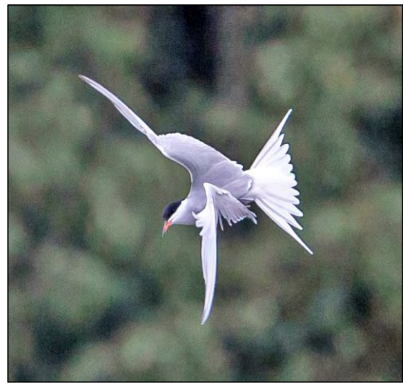
Little Egret and Common Tern