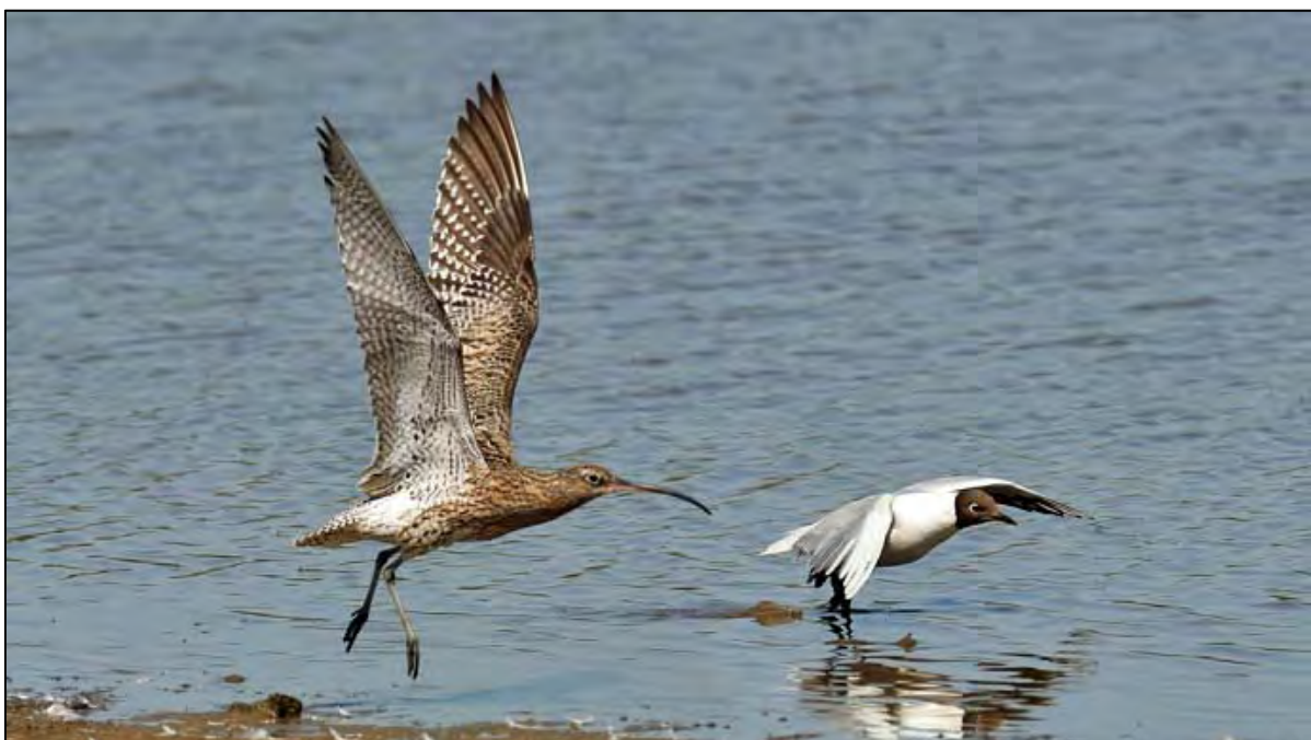
Curlew and Black-headed gull