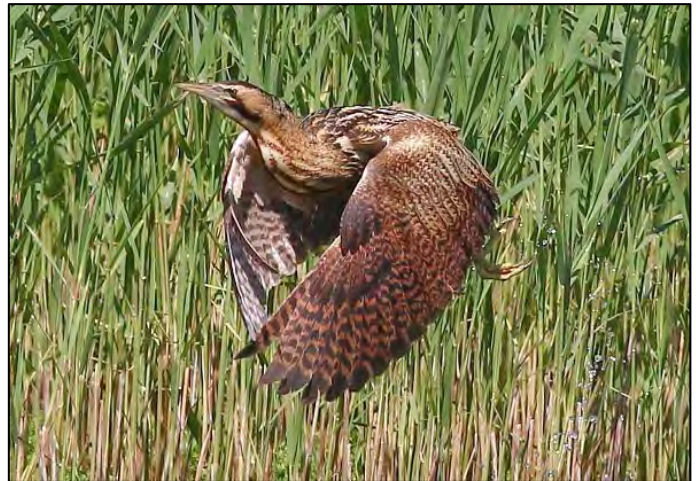
Hobby and Bittern, both in June