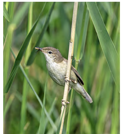
Reed warbler