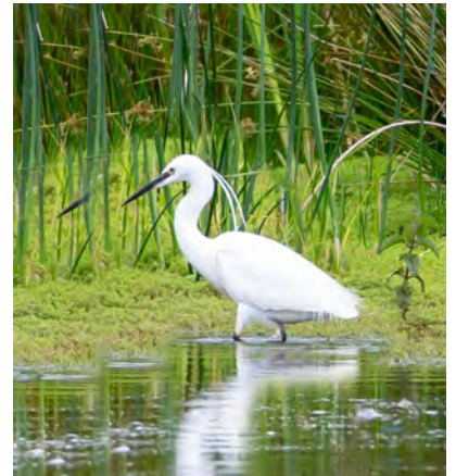
Little egret