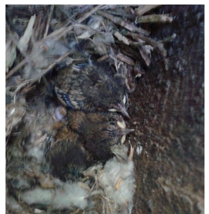
Treecreeper young in nestbox