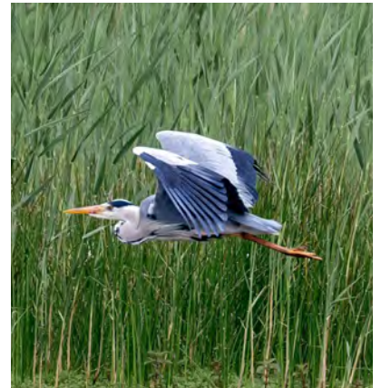
Grey heron © Vernon Barker