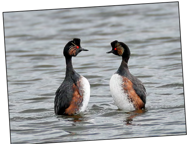
Mute swan and cygnets and displaying Black-necked grebe