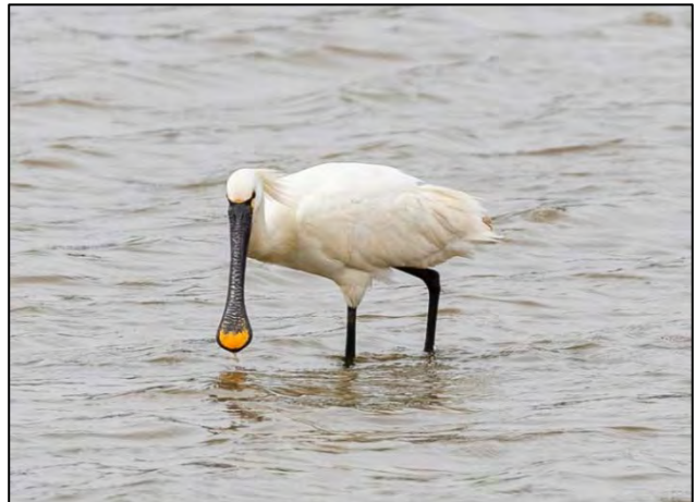
Common tern on 3rd and Spoonbill on 13th June