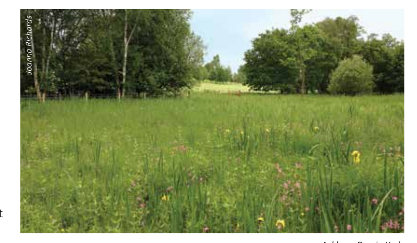
Askham Bog in York.

Now more than ever wildlife need you on its side. Yorkshire Wildlife Trust is at the forefront of campaigns for bigger and better Marine Protected Zones, mitigation for HS2 and making sure our 54 MPs see environmental protection as a priority. This year our planning team will be asked to comment on over 400 planning applications ranging from destruction of ancient woodlands to removal of wildlife protection. They have a good record of success when they do comment but Yorkshire is a huge county and they simply can't research every application they're asked to look into. Your dedicated support could make all the difference, ensuring ensuring harmful development is checked and Yorkshire's wildlife protected.