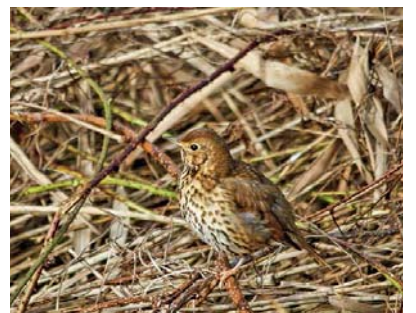
Song thrush © Boguslawa Piatkowska