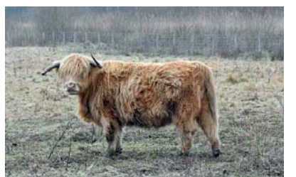
Highland cattle conservation grazing © Justin Parker