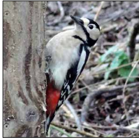
Water rail on 22nd and Great spotted woodpecker