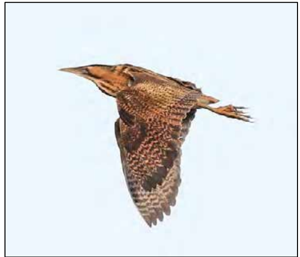
Iceland gull on 8th January and Bittern on 20th