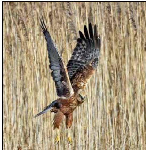
Jay and Marsh harrier