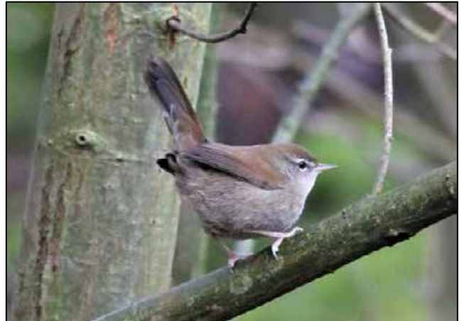
Marsh tit on 11th January and Cetti's warbler on 8th