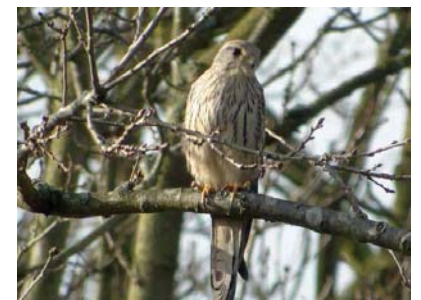
Kestrel