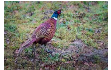
Pheasant © Kieron Wobschall