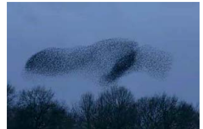
Starling murmuration