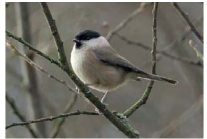
Marsh tit