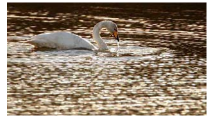
Whooper swan