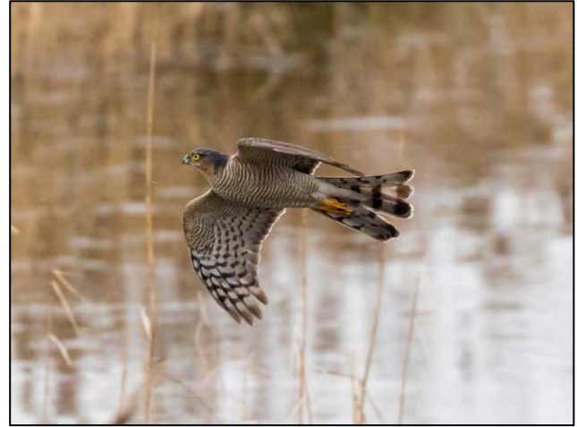
Smew on 2nd and Sparrowhawk on 14th