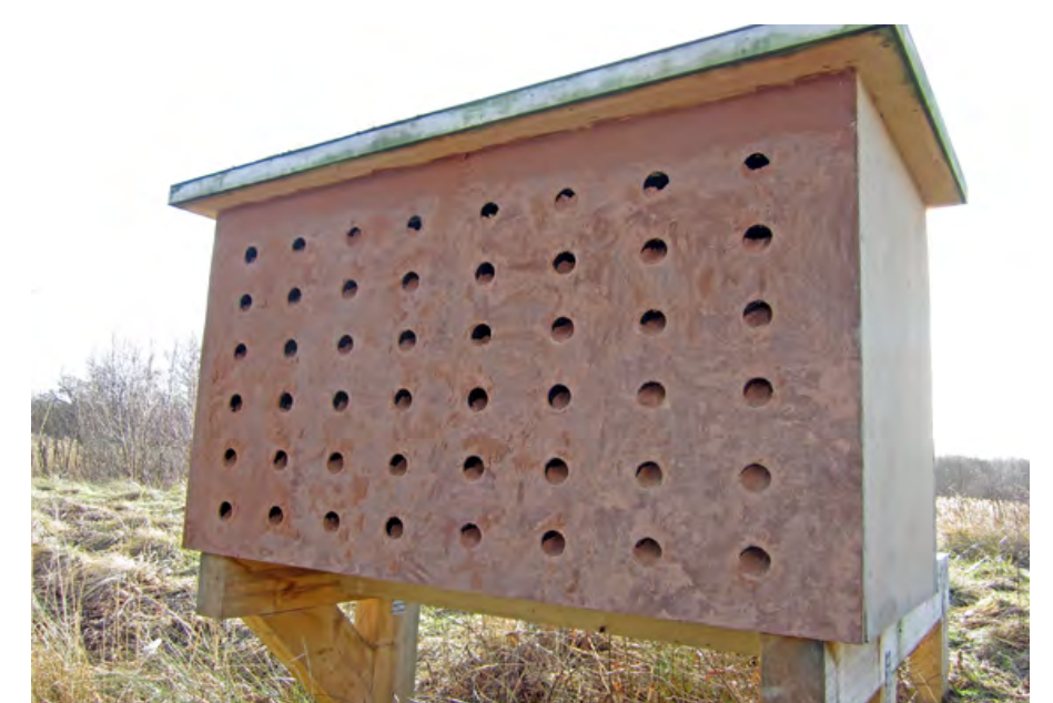
The Sand martin wall has vacancies