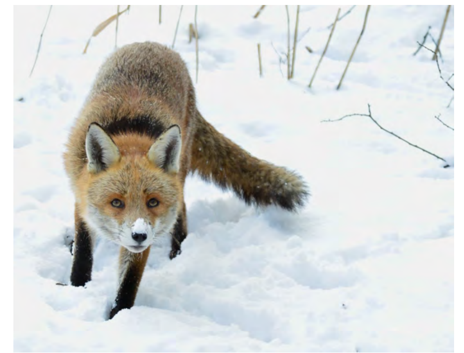
Fox in the snow on 28th February