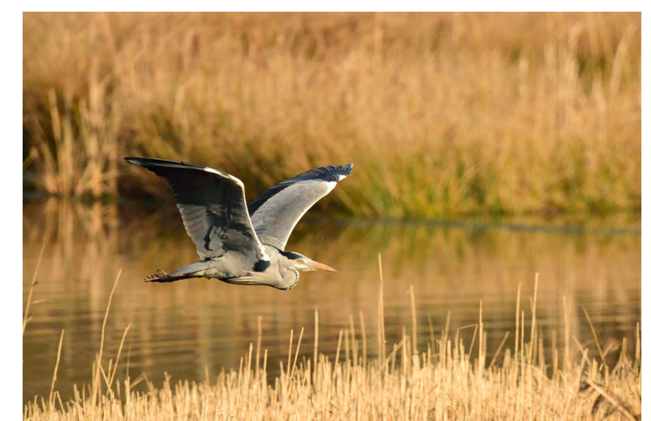
Grey heron