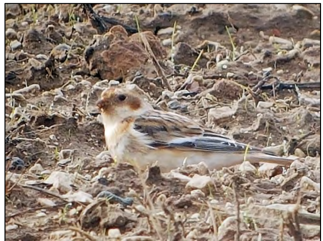
Iceland gull at the iPort lakes on 19th and Snow bunting also at the iPort lakes on 18th