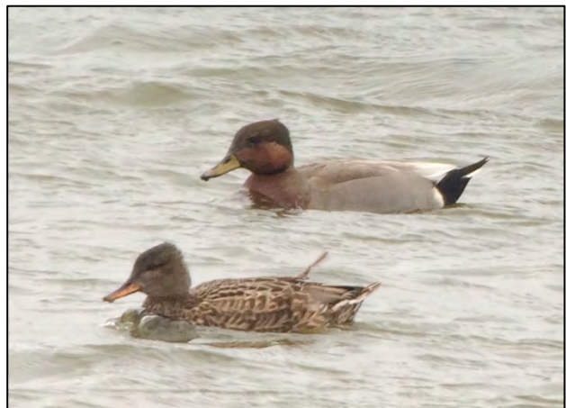
The Sand martin wall at Decoy Lake had its sand renewed in February and hybrid Mallard x Gadwall with female Gadwall on the Lagoon on 14th