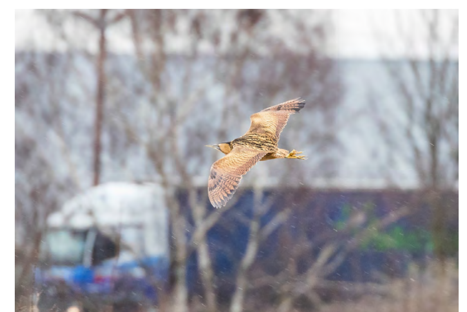
Bittern over Huxter Well Marsh with M18 traffic in the background