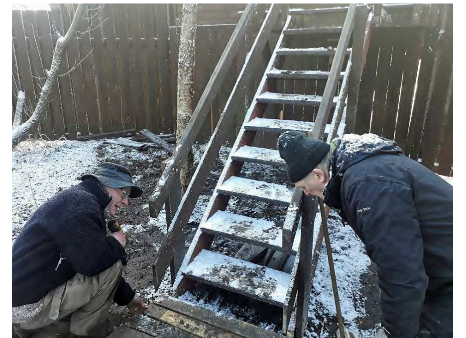
Skilled practical volunteers repairing the steps at Beeston Hide