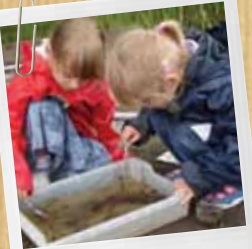
Encounter pond creatures