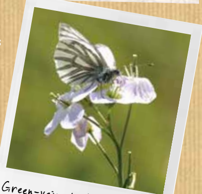
Green-veined white butterfly